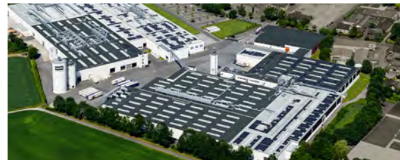
HUGA Gütersloh, Timber doors