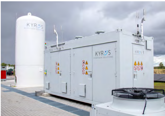
With the local production and process heat application of hydrogen, we are investing in green energy generation at our Ichtershausen site.