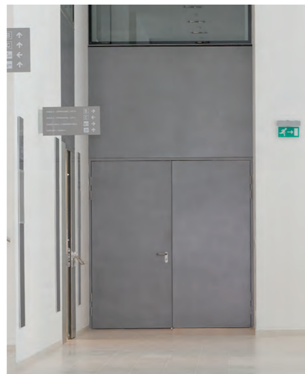
High-quality, safe and tailor-made – our steel doors meet the highest demands.