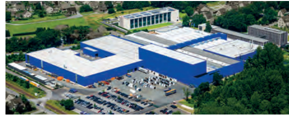
HÖRMANN Amshausen, Garage doors, storage space systems