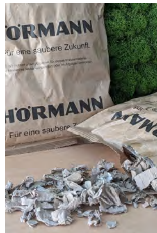
Less waste and more recycling – reusable packaging and production waste is processed and returned to the cycle of reusable materials.