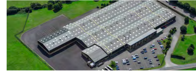
GARADOR Yeovil, UK, Garage doors