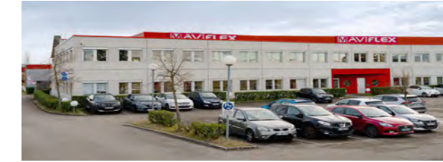
MAVIFLEX Décines, Frankreich, High-speed doors