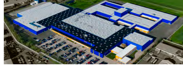
HÖRMANN Brandis, Entrance doors, steel doors