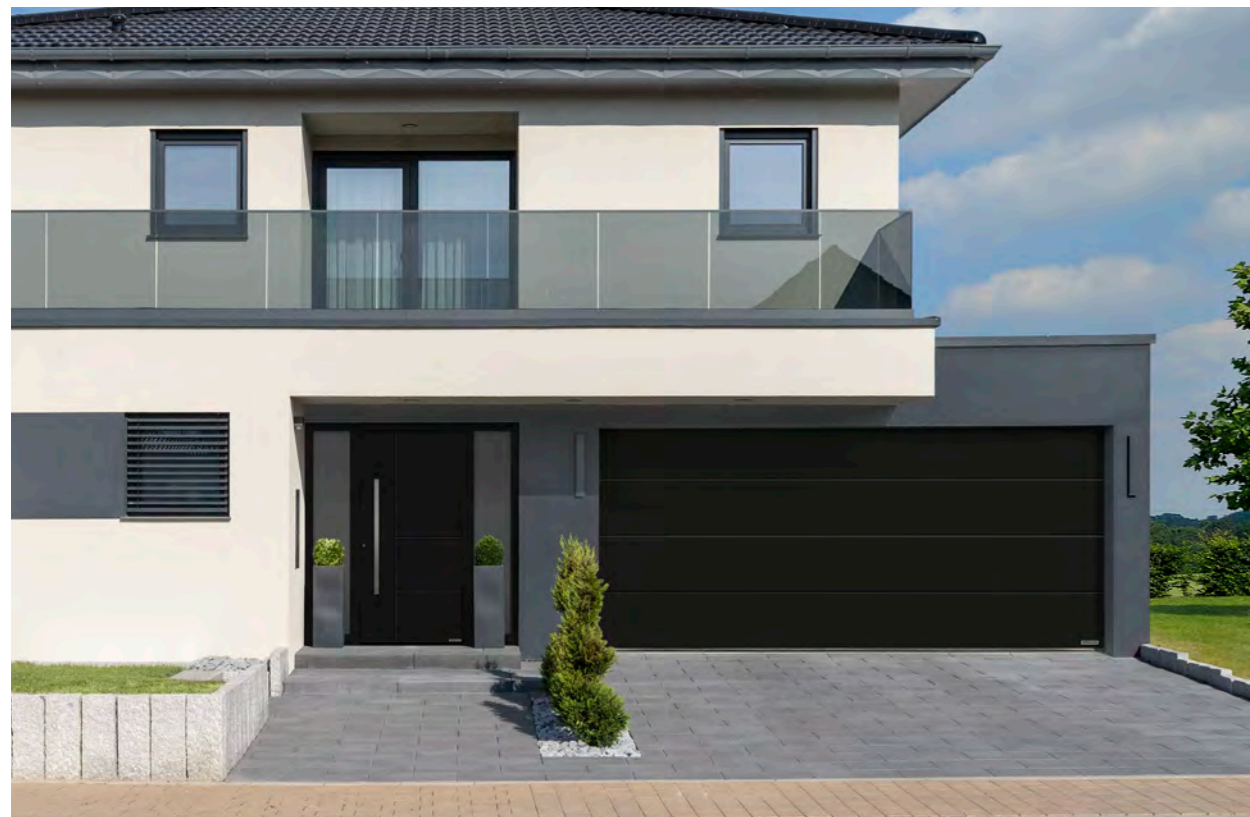
Entrance doors and garage doors with matching appearance blend harmoniously into the architecture of detached houses.