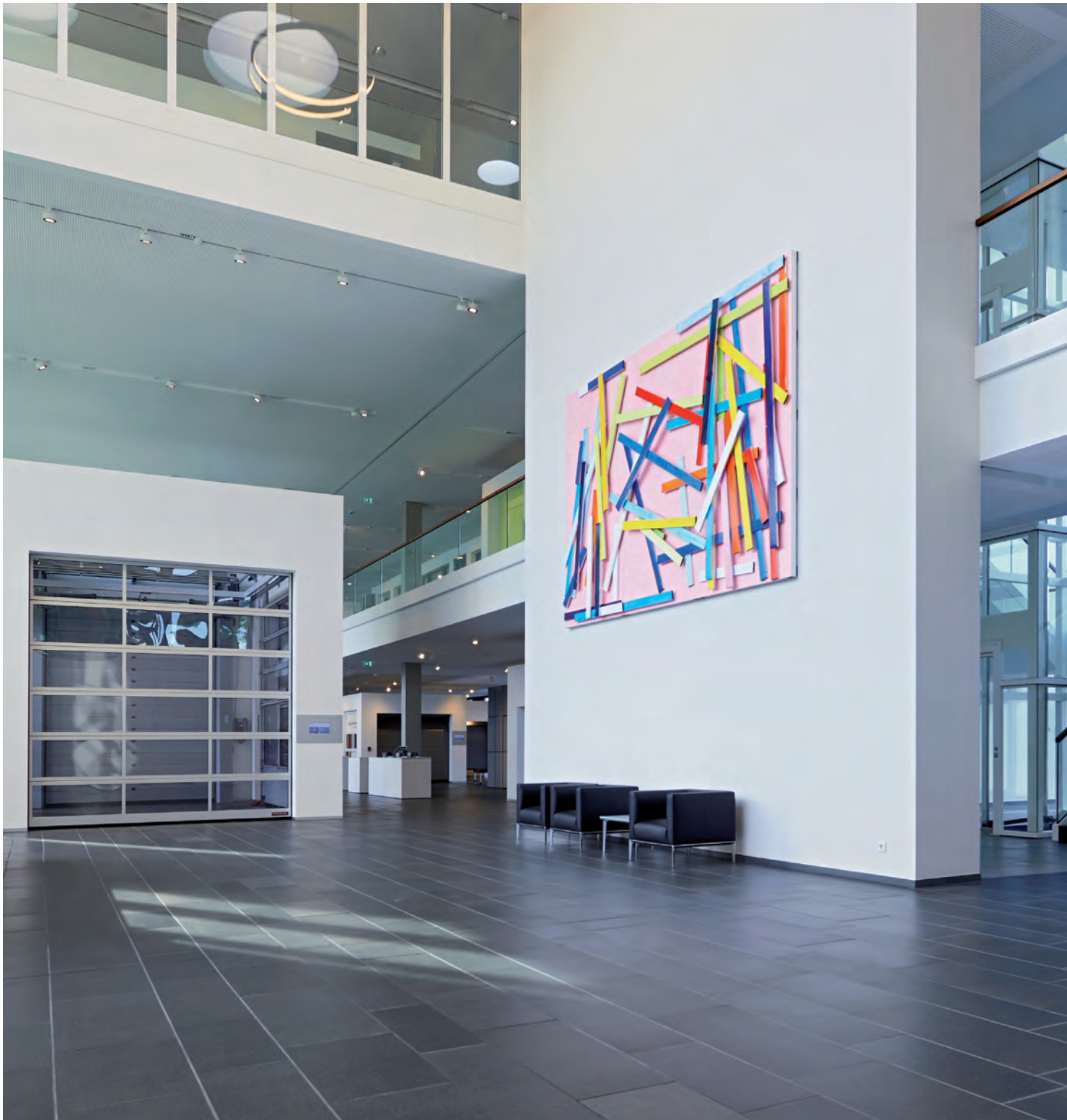
On three floors and over 2500 square metres of exhibition space, a variety of doors and operators, loading technology and perimeter protection systems are presented.