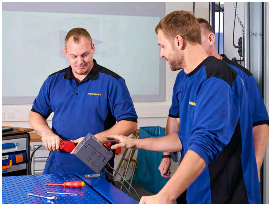
Training is offered at several locations.