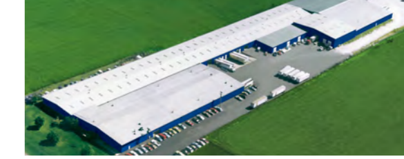
HÖRMANN Montgomery IL, USA, Garage doors, industrial doors