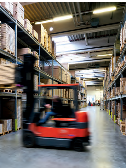
The products then leave the warehouse and reach our customers.