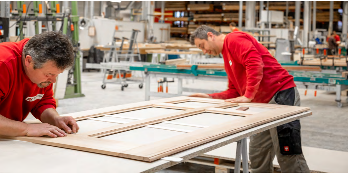
Selected raw materials form the basis for our high-quality products.