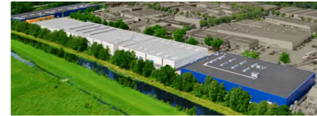
HÖRMANN Alkmaar, Niederlande, Loading technology