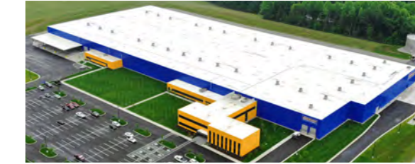
HÖRMANN Sparta TN, USA, Garage doors, industrial doors