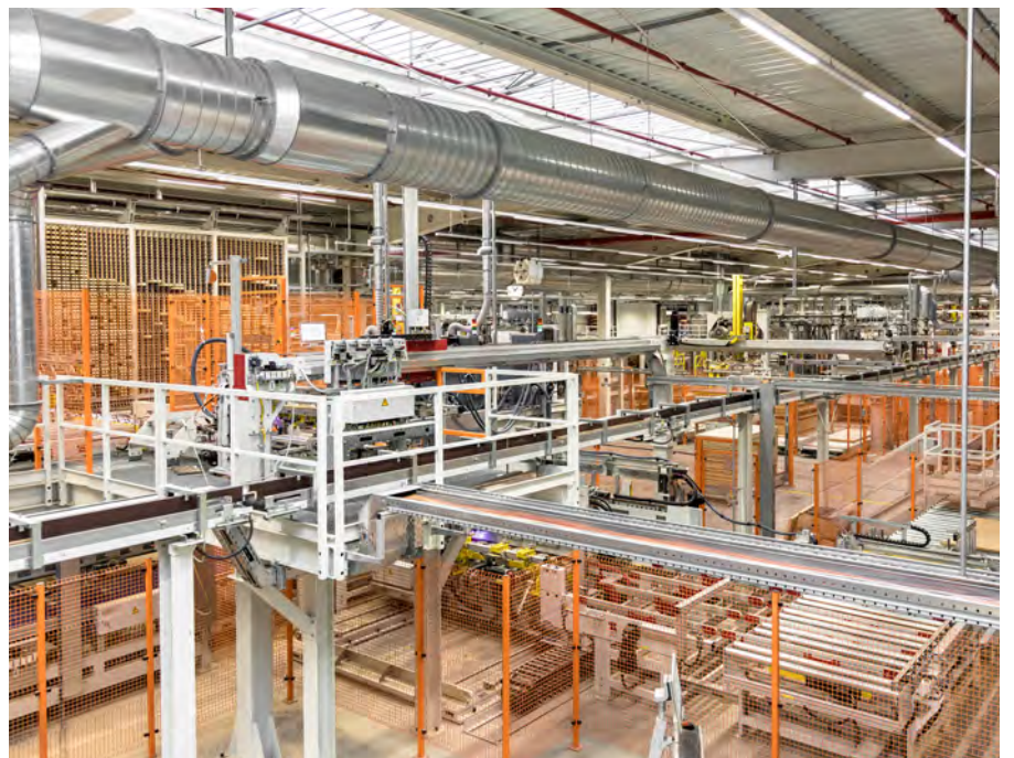
The modern production lines of Hörmann factories guarantee optimal production processes.