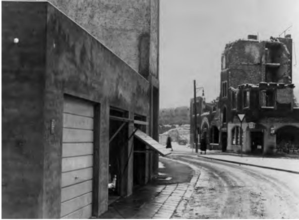
New start after the war – the first up-and-over garage doors were delivered by Hörmann in 1952.