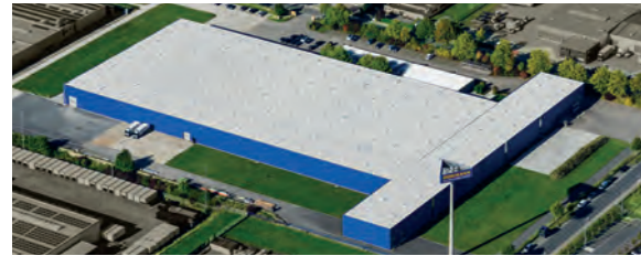
HÖRMANN Dissen, Industrial doors