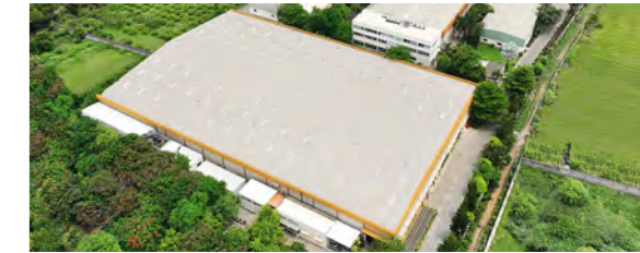
SHAKTI HORMANN Secunderabad, India, Industrial doors, loading technology, steel doors