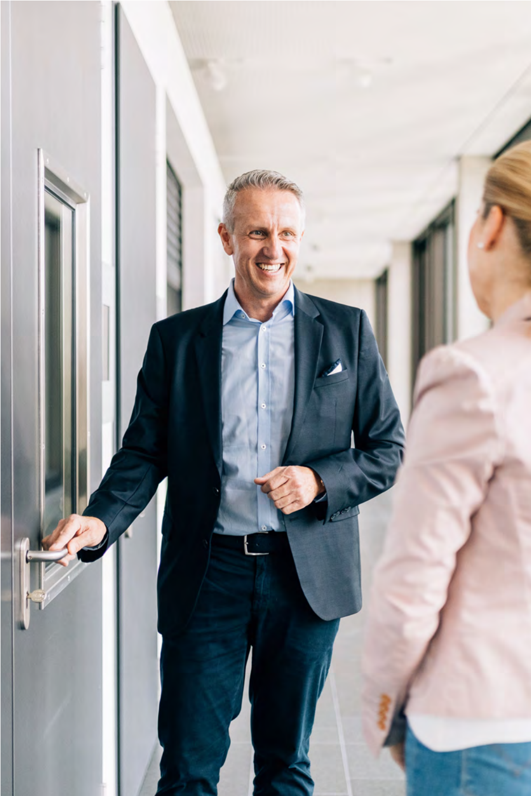
Respect, commitment and courage are crucial for successful cooperation