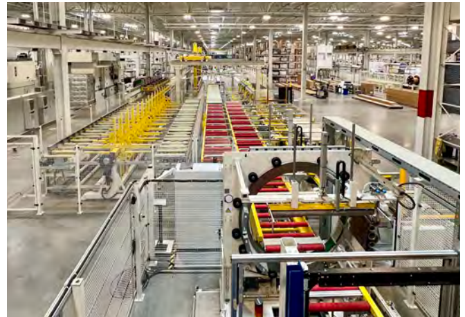
Globally uniform standards guarantee uncompromising quality.