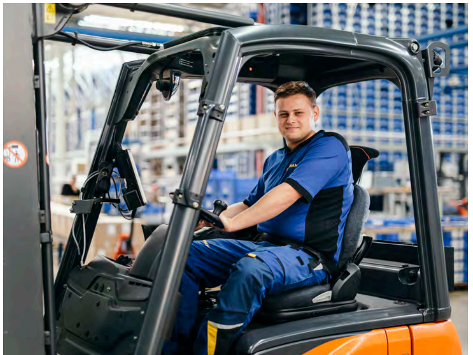
In the factories, perfectly planned processes ensure that products reach customers quickly.