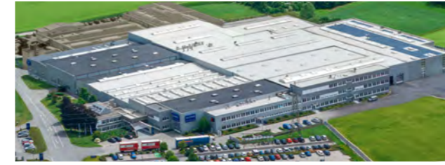
TORTEC Wolfsegg, Austria, Steel doors, sliding doors