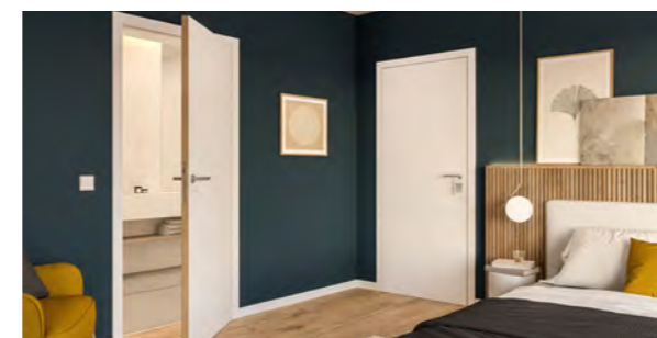
Timber doors combined with steel frames are a durable and hard-wearing solution for hotels