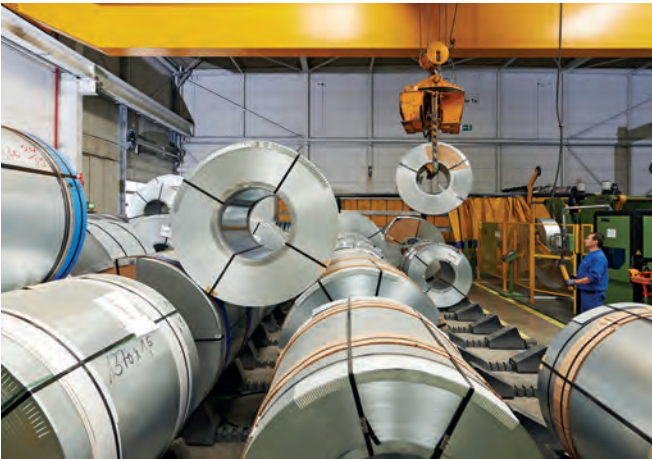
Production begins with the steel coil and ends with the finished door.