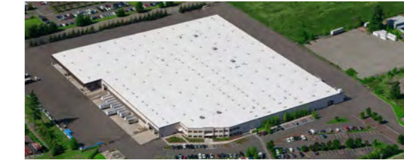
HÖRMANN Puyallup WA, USA, Garage doors, industrial doors