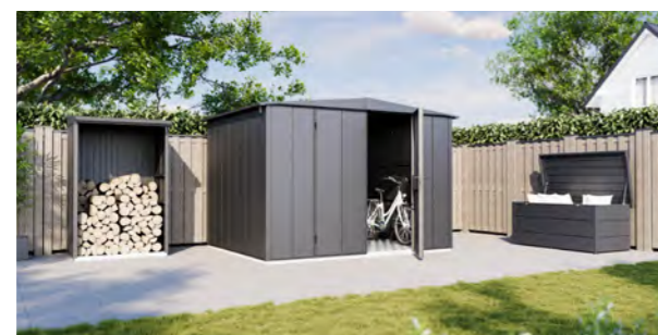
Our storage space systems offer plenty of space in the garden.