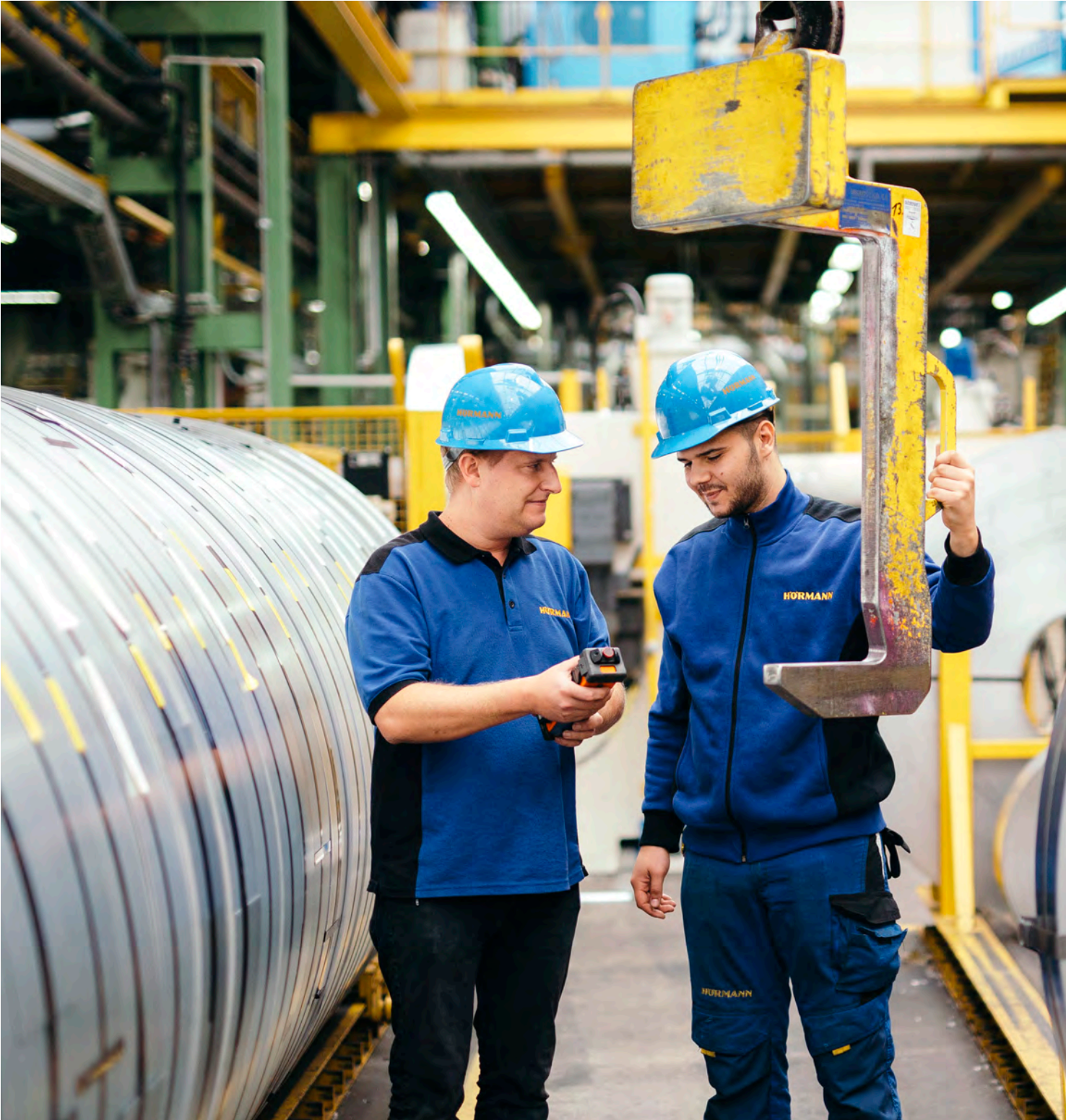
Our highly qualified employees ensure that customers receive the best product.