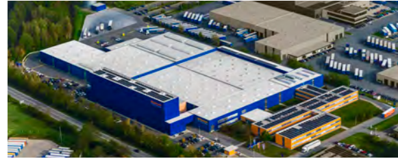
HÖRMANN ANTRIEBSTECHNIK Steinhagen, Operators, controls