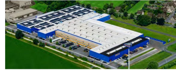
HÖRMANN Werne, Steel frames