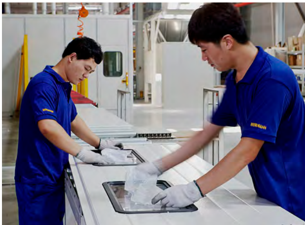
The quality of our products secures our competitive edge.