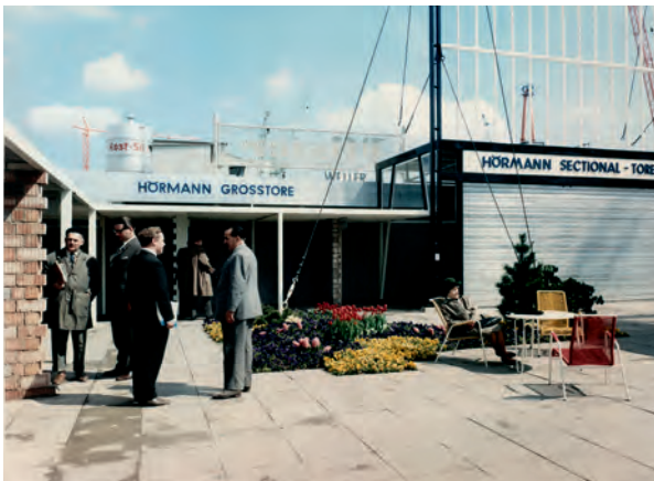
Hörmann presented the new sectional door at the Hanover Exhibition in 1970.

The Hörmann Group. From the 1960s onwards, further company locations were established. New products such as fire-rated doors, door frames and sectional doors were a great success. An important contribution was made by the completely restructured sales, with a central sales company.