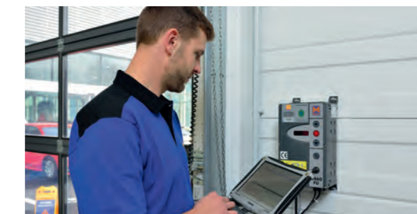
Proper use and regular maintenance increase the long service life of our products.