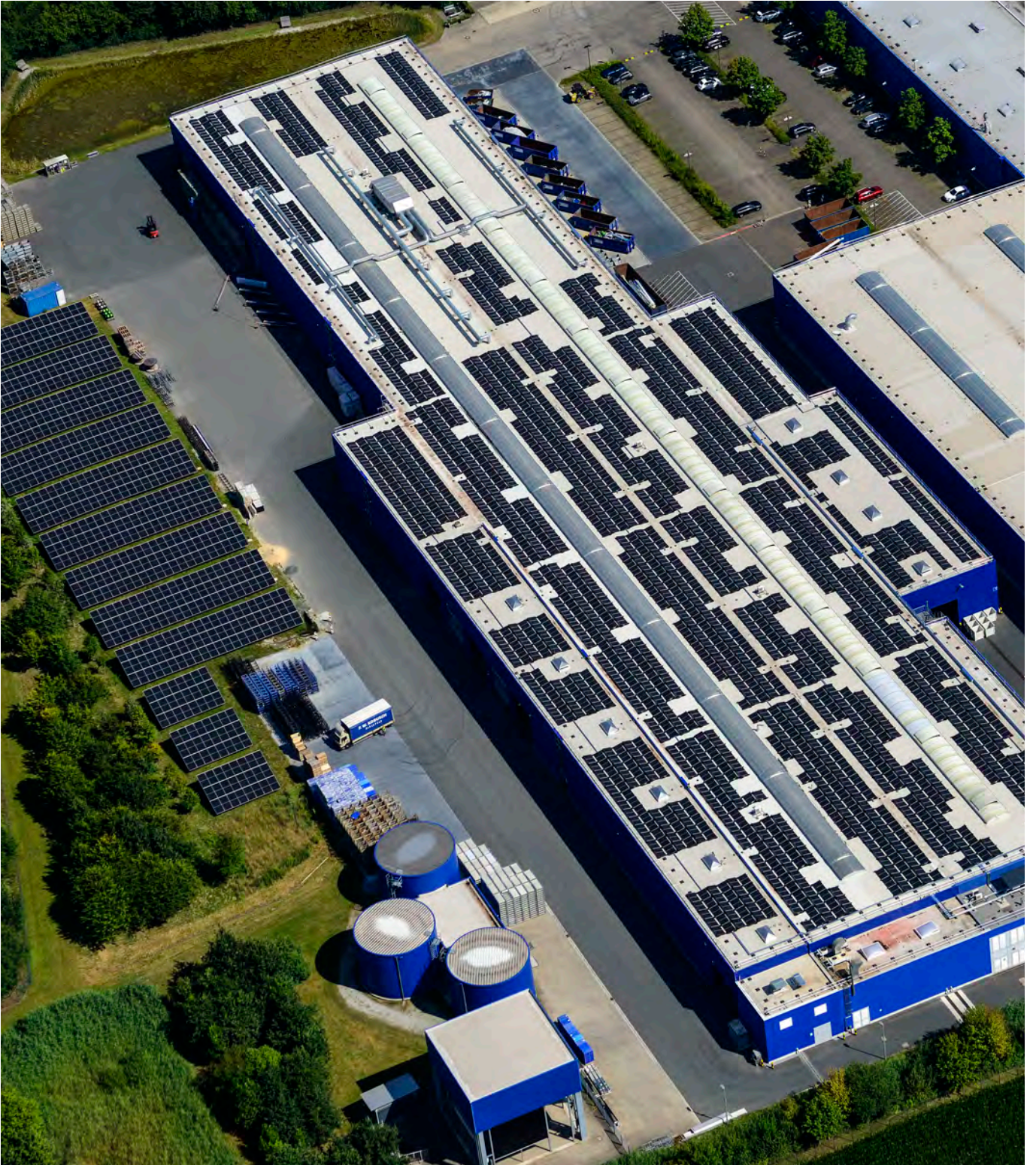
Photovoltaic systems on many of our buildings produce green electricity.