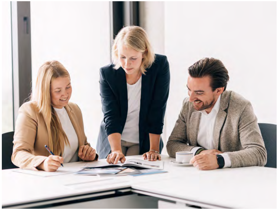
The Hörmann Forum offers perfect conditions for seminars and training courses.