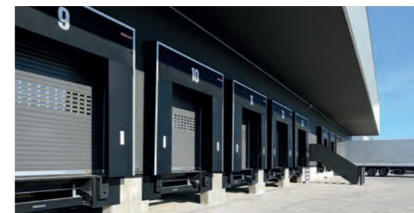
In addition to industrial doors, Hörmann also offers trailblazing loading technology.