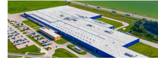
HÖRMANN Legnica, Polen, Loading technology, box frame doors, garage doors