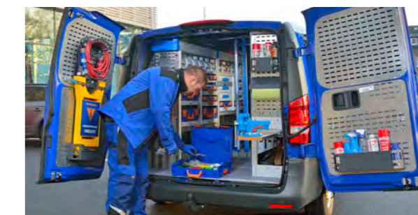
Our technicians are available in many countries on seven days a week and around the clock.