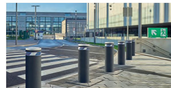
Perimeter protection systems guarantee security and flexibility.