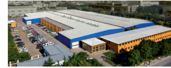
HÖRMANN Beijing China, Steel doors