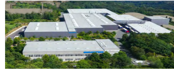
SEUSTER Lüdenscheid, High-speed doors