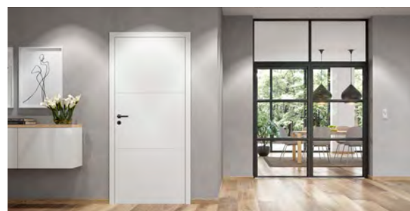
Timber doors and loft doors create a modern living atmosphere.