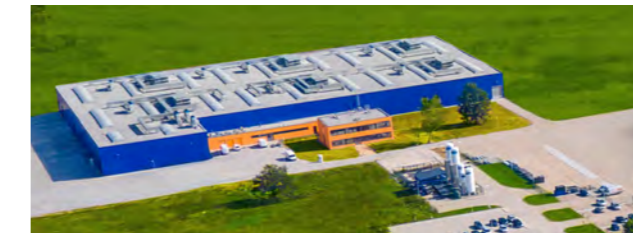
HÖRMANN Gromadka, Polen, Storage space systems

Other factories HÖRMANN Oensingen, Schweiz, operator booms BERNER EAZYMATIC Birmenstorf, Schweiz, operators, controls TRANSDEK Harworth, UK, loading technology