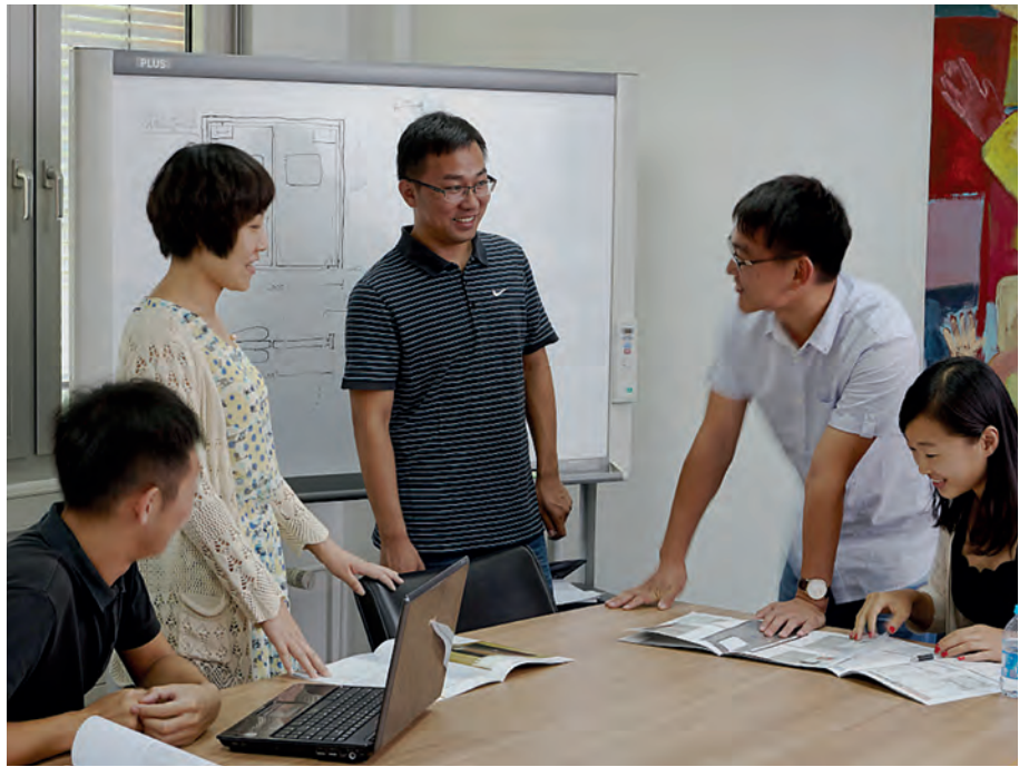
We develop the best solutions to meet new technical challenges.