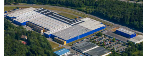
HÖRMANN Eckelhausen, Entrance doors, box frame doors