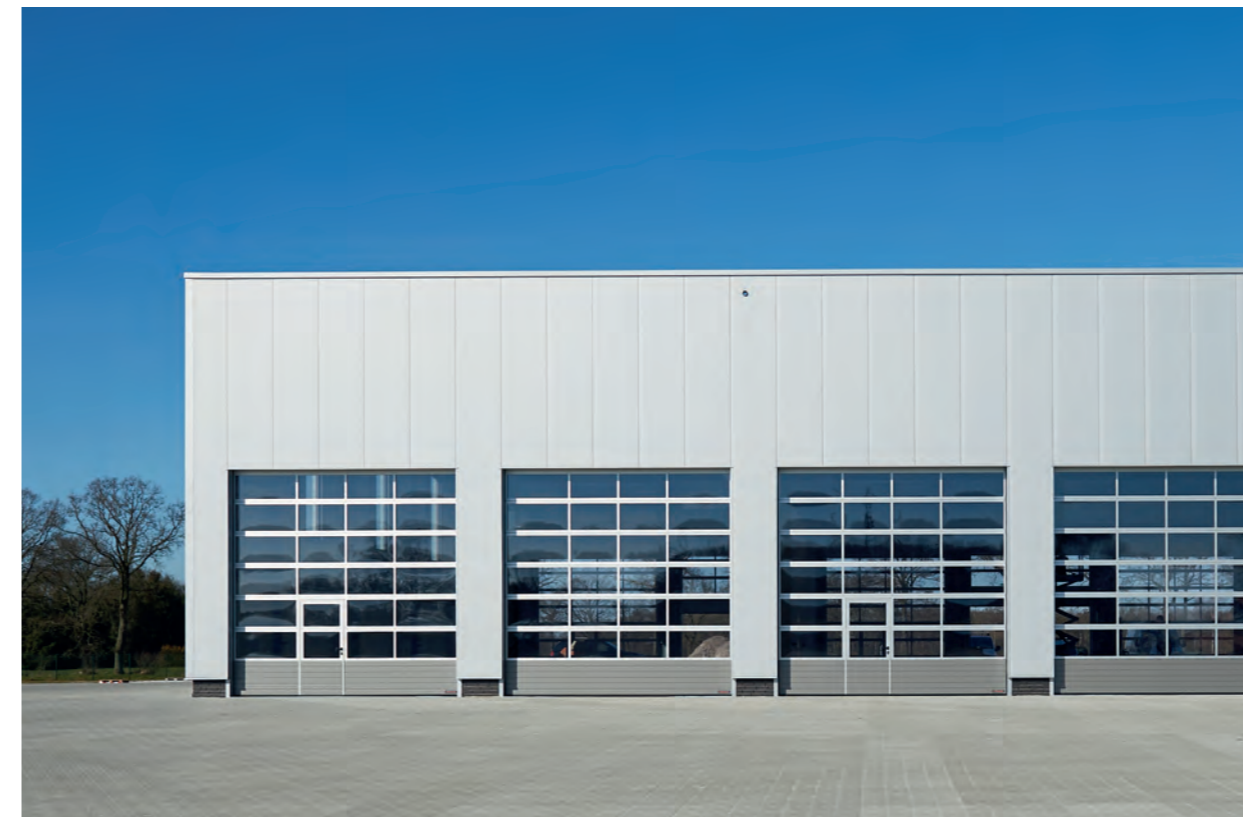
Commercial and industrial customers rely on our proven and innovative industrial doors.