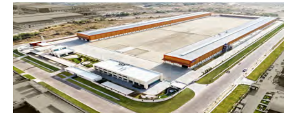
SHAKTI HORMANN Jaipur, India, Timber doors, steel doors