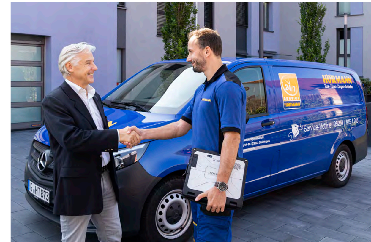
Our network of over 500 service technicians in Europe guarantees speed and flexibility.