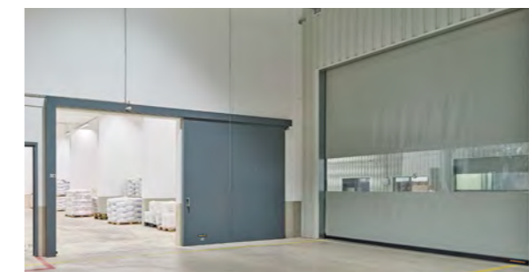
Sliding doors and high-speed doors are used in production and logistics halls.