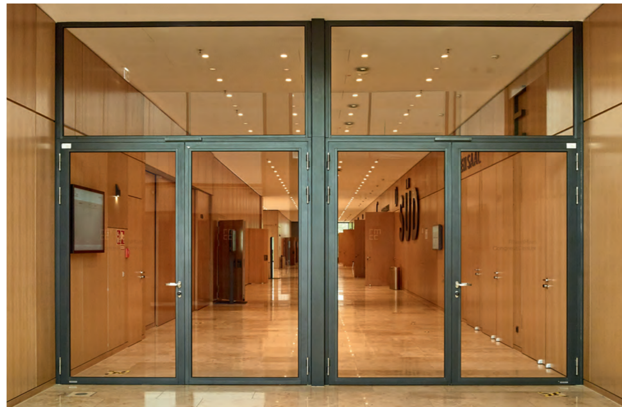
Glazed box frame doors lend transparency to the architecture.