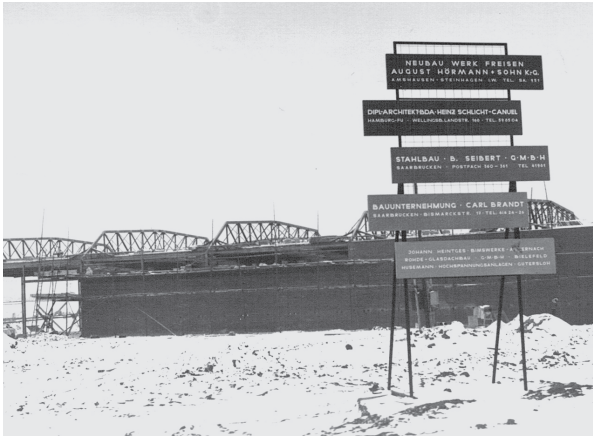
In the early 1960s, a second Hörmann location was established in Freisen, Saarland.