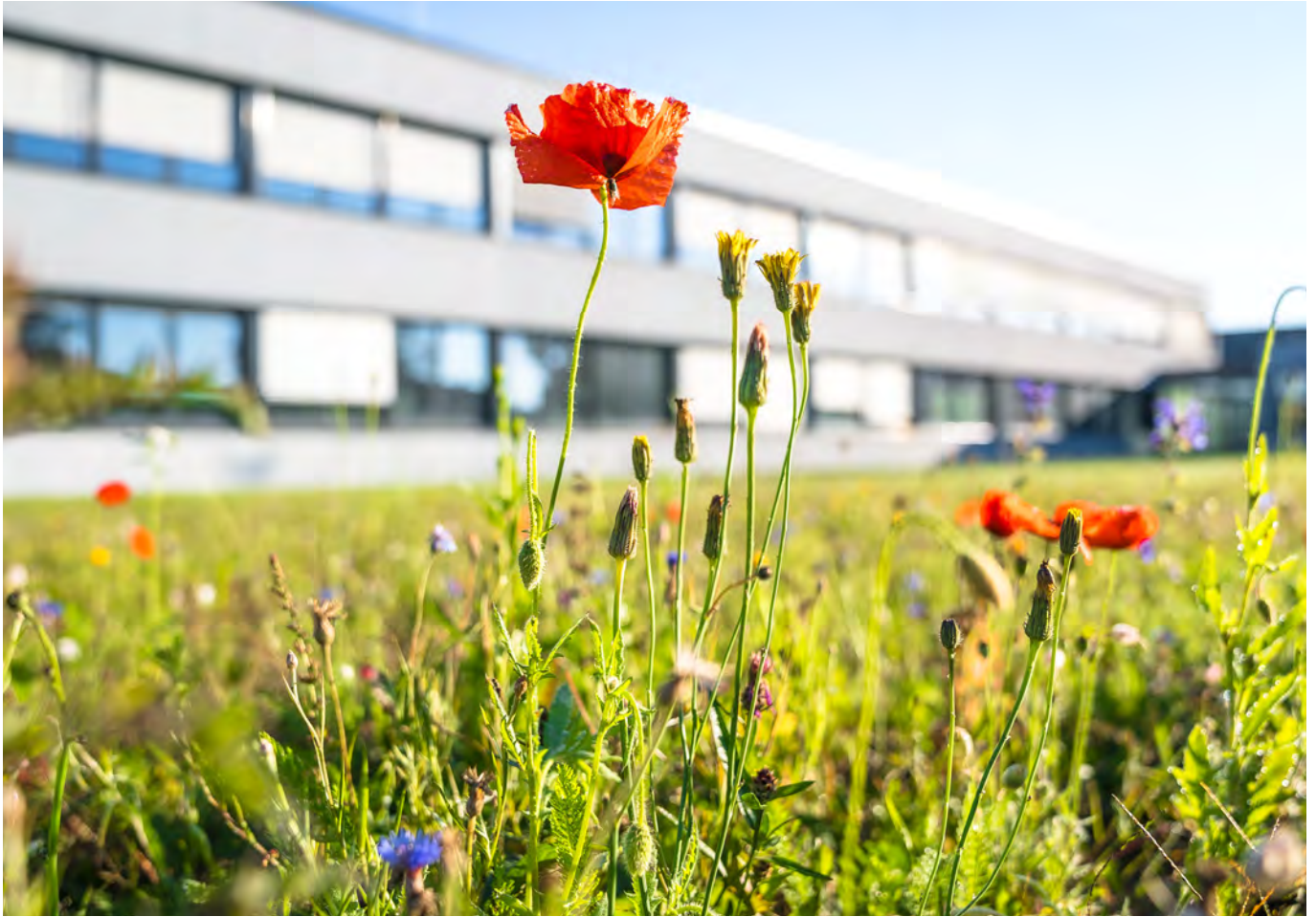
In addition to reducing emissions, we also create natural CO 2 reservoirs such as green roofs, bee meadows and pasture areas.