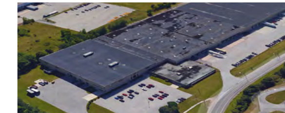
HÖRMANN Barrie, Canada, Industrial doors