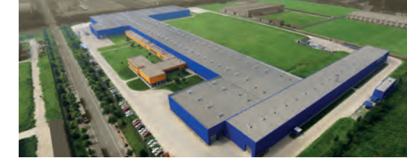
HÖRMANN Tianjin China, Industrial doors, loading technology