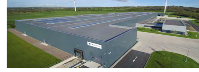
IG DOORS Oakdale, UK, Entrance doors