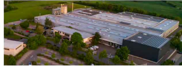
NEUFORM Zeulenroda, Timber doors