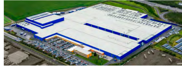
HÖRMANN Ictershausen, Garage doors