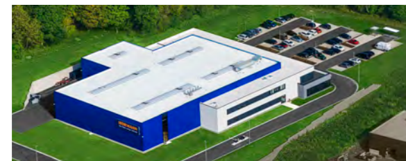
HÖRMANN Mengerskirchen, Barriers, car park and parking lot systems