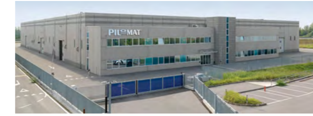
PILOMAT Grassobbio, Italy, Perimeter protection systems