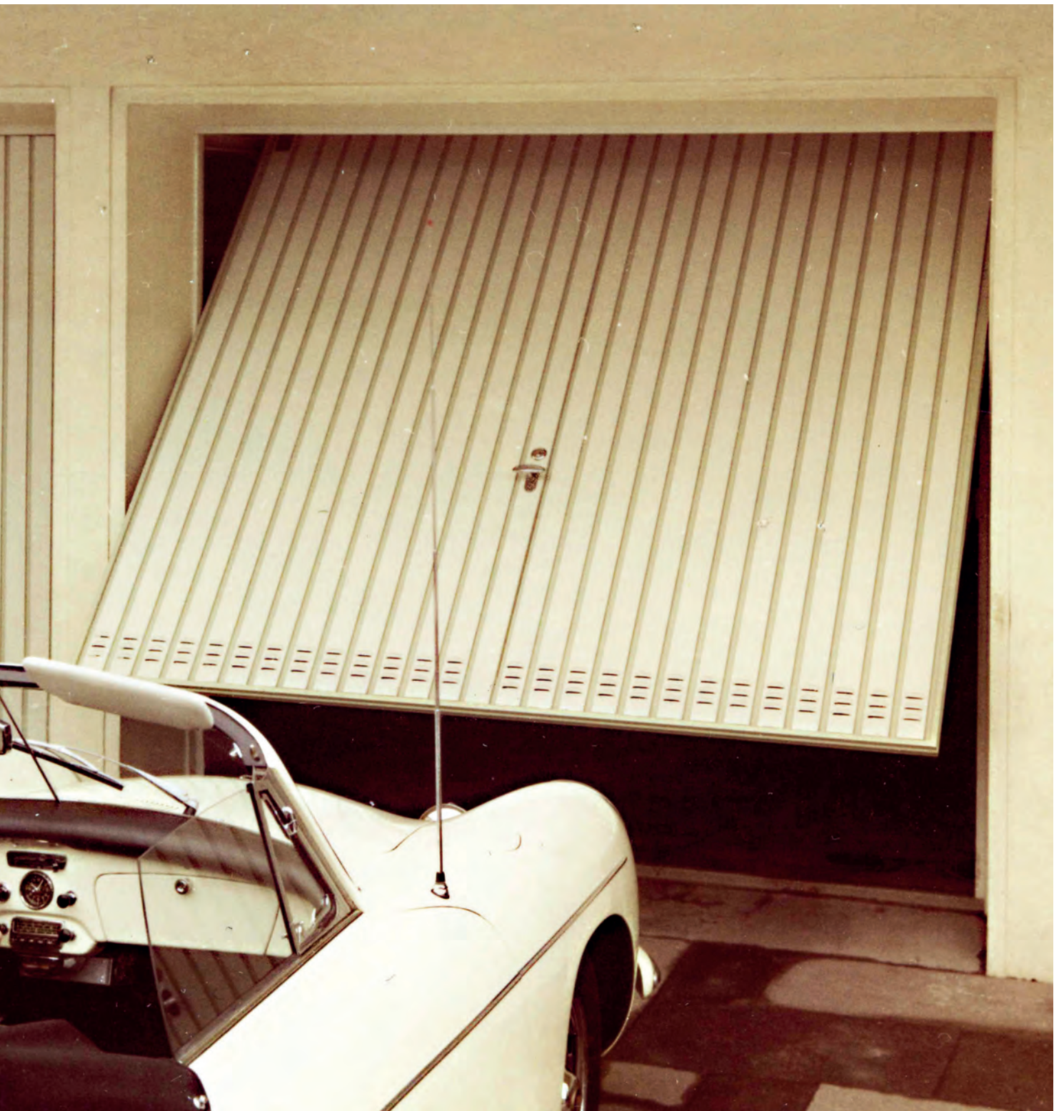
Hörmann conquered the German market with the up-and-over garage door.