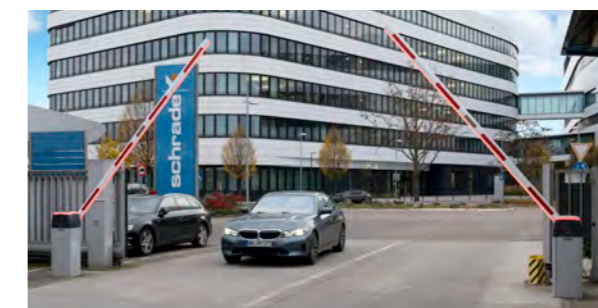
Our barriers can be used in a variety of ways.