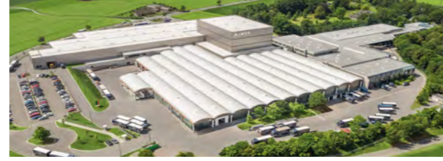
ALUKON Konradsreuth, Roller shutters, sun protection and insect protection