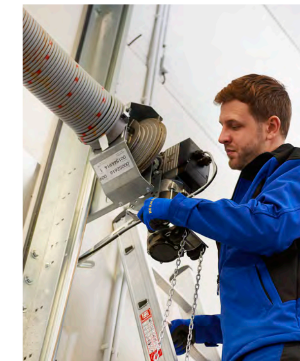
Technicians certified by us know exactly what to do. After all, no one knows our products better than us.