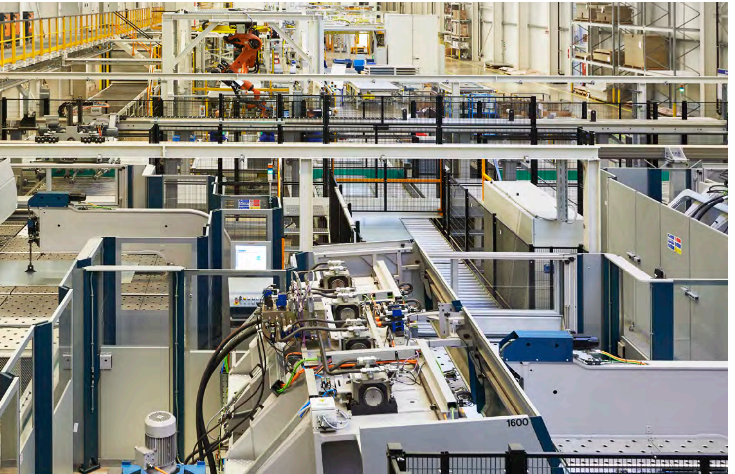
Efficient manufacturing through continuous investment in production facilities.