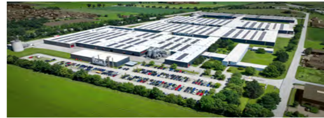
SCHÖRGHUBER SPEZIALTÜREN Ampfing, Timber doors

Find out more about our production sites at www.hoermann.com/en/hoermann-worldwide