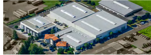
BERNER TORANTRIEBE Rottenburg, Operators, controls