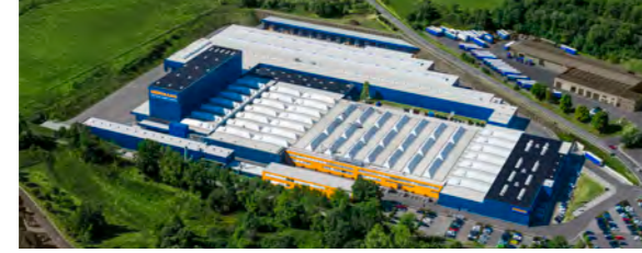
HÖRMANN Freisen, Steel doors