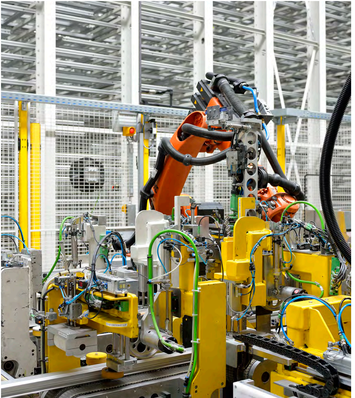
Automated production ensures efficiency and guarantees the highest product quality.