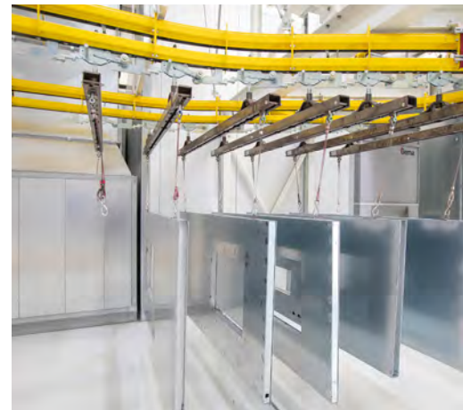
Galvanised steel doors on their way to powder coating