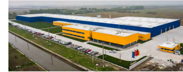
HÖRMANN Changshu China, Steel doors