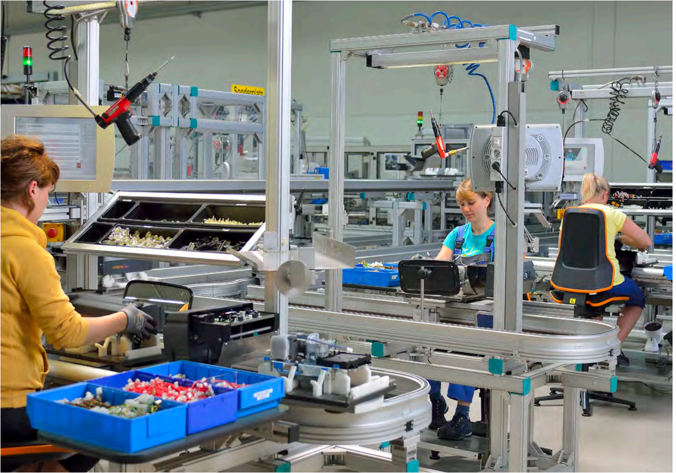
We conform to the highest safety standards and optimum working conditions, while also ensuring efficient production processes.