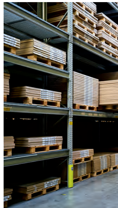
Storage in high-bay warehouses enables fast delivery times.