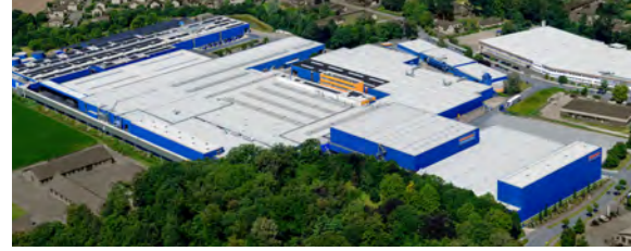
HÖRMANN Brockhagen, Garage doors, industrial doors