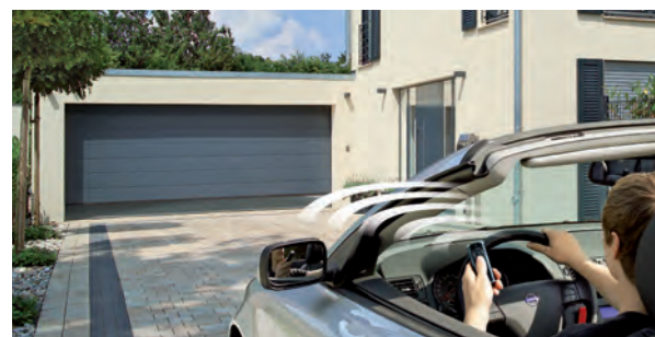
Automatic garage doors with operators enable convenient access to garages