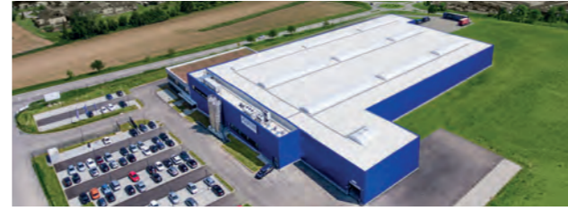
ALUKON Haigerloch, Roller shutters, sun protection and insect protection

Find out more about our production sites at www.hoermann.com/en/hoermann-worldwide