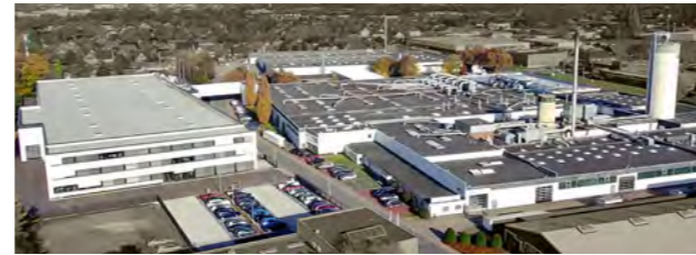
LEBO Bocholt, Timber doors

Other factories SC ELECTRONIC SERVICE Herford, electronic components NEUFORM Erdmannhausen, timber frames SCHÖRGHUBER SPEZIALTÜREN Jahrdorf, timber doors GROTHAUS Melle, double-action doors, insulating doors