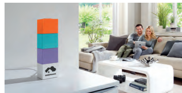
Convenient control via smartphone or tablet with our Smart Home system