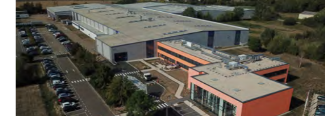
TUBAUTO Sens, France, Garage doors